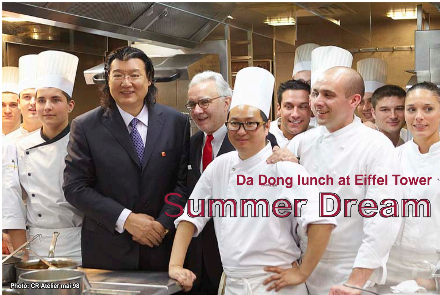
mai 98